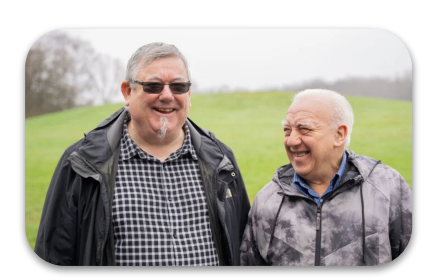
Age inclusive imagery